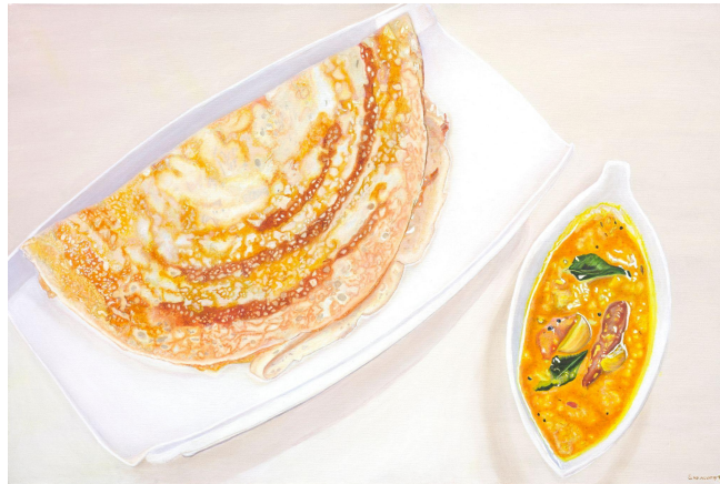
Dosa and Sambar (2019), Oil on Linen