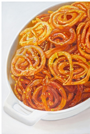
Jalebi (2021), Oil on Linen

cutting-edge work that deals intelligently with issues of gender and cultural representation. Our public programs present the creative work of South Asian womxn in multiple disciplines through salons, talks, workshops, readings, screenings, performances, and exhibitions. SAWCC connects womxn of South Asian descent with links to various communities and encourages their growth as artists by providing a platform to exchange ideas and feedback on their creative work and network with other South Asian womxn artists, educators, community workers, and professionals. Members include those who identify as South Asian women, femmes, queer, trans, nonbinary, and gender nonconforming people.