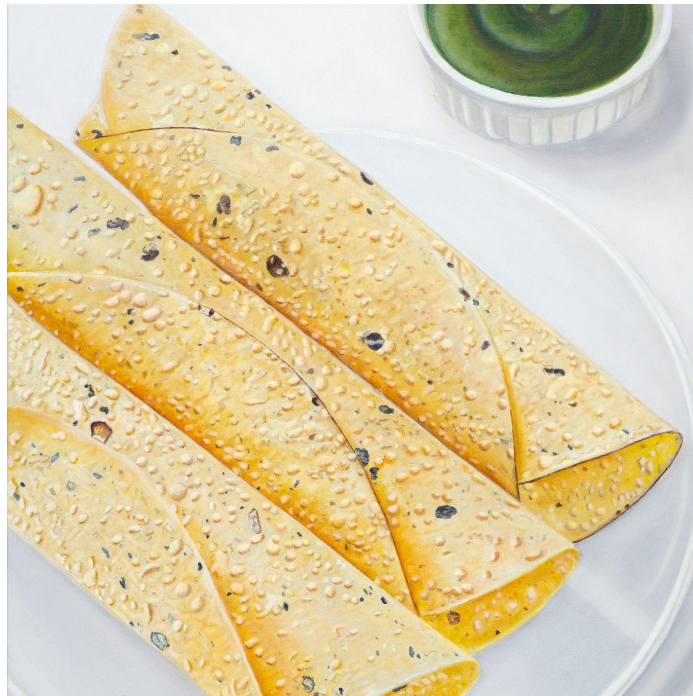
Papad (2021), Oil on linen

Gallery Hours: Fri, 11am-6pm; Sat, 11am-6pm; Sun, noon-4pm